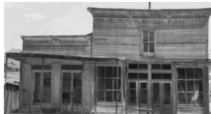
Bodie State Historic Park